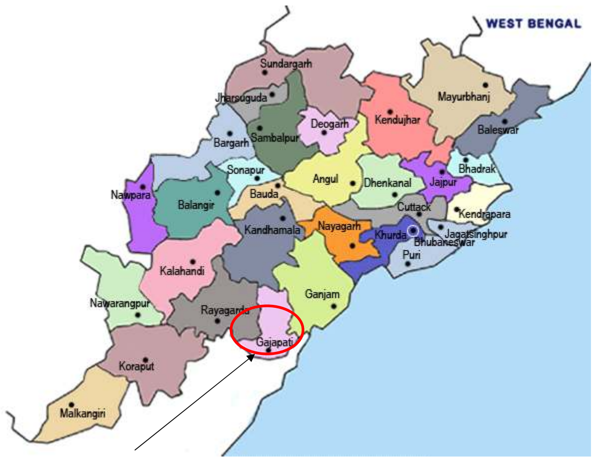
LOCATION MAP OF GAJAPATI DISTRICT